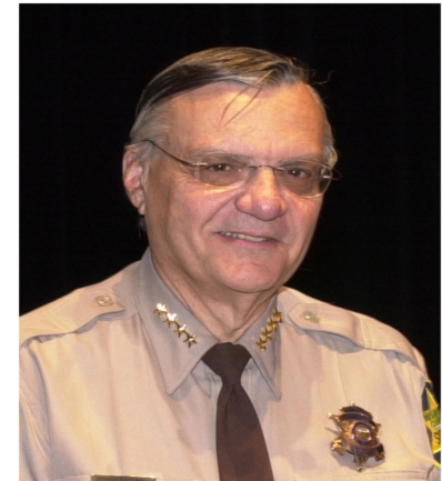
Sheriff Joe Arpaio Maricopa County Arizona